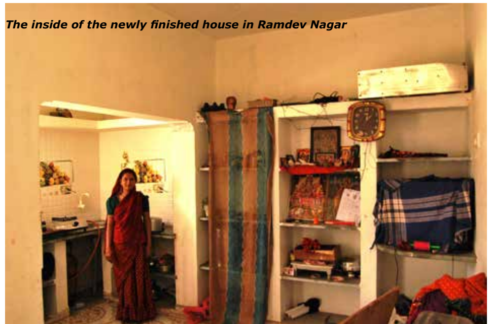
The inside of the newly finished house in Ramdev Nagar

The project has received tremendous support from the state and central government and once the implementation is complete, post occupancy data shall be generated to advocate the approach of people-centric slum redevelopment to other cities as well.