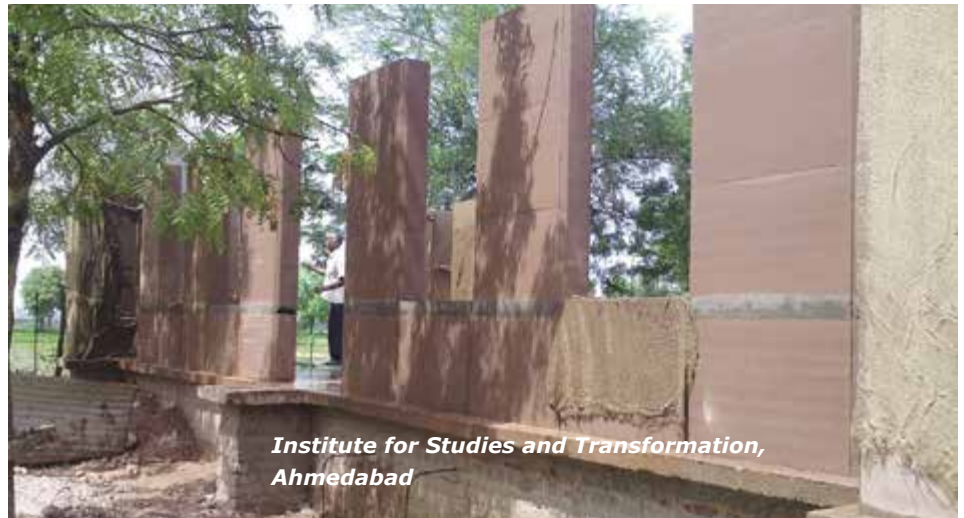
Institute for Studies and Transformation, Ahmedabad

“Layers- The rammed earth construction company” completed casting of stabilized rammed earth walls in the ground floor and first floor of the designed facilities.