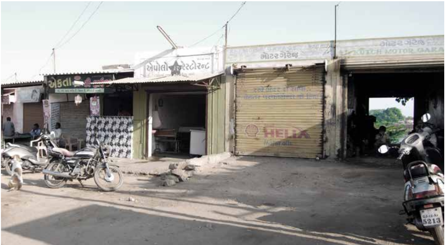
Currently Desalsar lies hidden surrounded by various small shops and informal settlements. Several of the activities around the lake are contributing towards degradation of the lake. Along with sewage inflow and garbage dumping, vehicle service centres around the lake can be seen as major threats to the lake ecology.