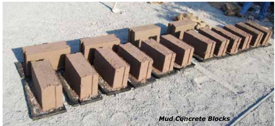
Mud Concrete Blocks