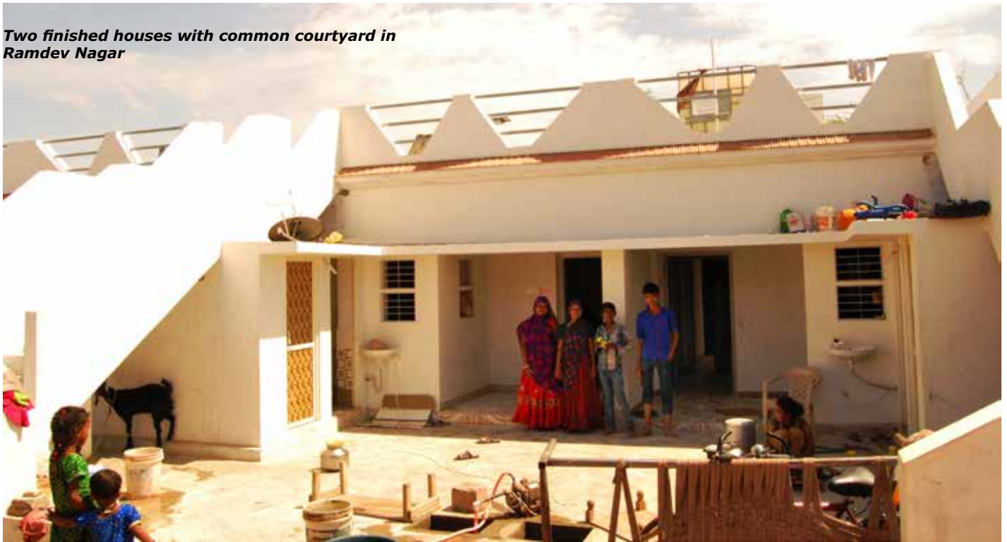
Two finished houses with common courtyard in Ramdev Nagar