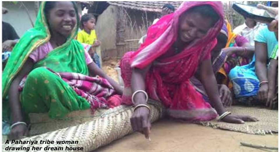
A Pahariya tribe woman drawing her dream house

A new project to design a school at a scenic site in Uttarakhand has been taken up by Hunnarshala. The school is for about 600 students in secondary and higher secondary levels. The site is spread over 1.5 Hectares of land. Currently work on the design proposal is going on, while the preliminary cost estimate has already been submitted to the client. The scope of work includes retrofitting of existing facilities as well as construction of new structures as per the necessary requirements. The project is funded by the Tata Relief Committee.