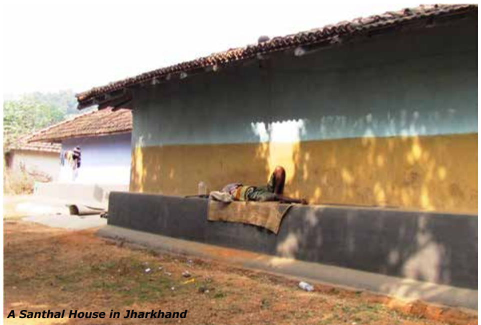
A Santhal House in Jharkhand