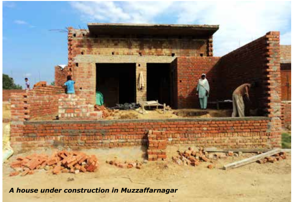
A house under construction in Muzaffarnagar

The rehabilitation and reconstruction work at Muzaffarnagar in Uttar Pradesh, for riot affected