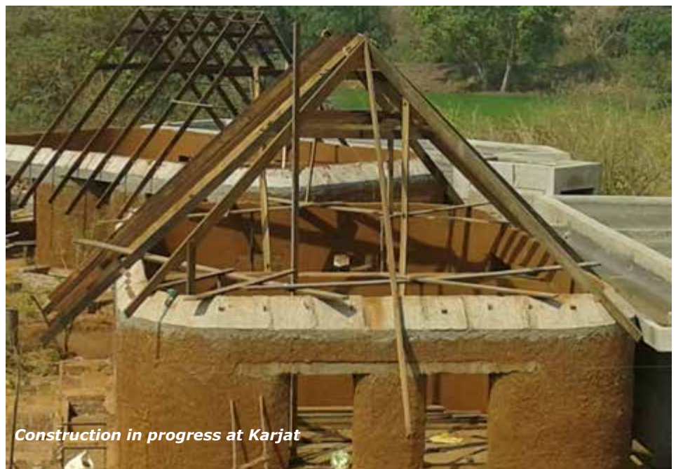
Construction in progress at Karjat

Based on the design of Kiran Vaghela - “Studiopot”, the artisan entrepreneur companies constructed a Recreation Centre, kitchen, dining and guest rooms at Karjat near Mumbai. Construction techniques like thatch roofing, wooden understructure, stabilized rammed earth and adobe walls have been incorporated in the design and implemented by various artisan entrepreneur groups. The first phase of the project is completed. At present the doors and windows work is in progress.