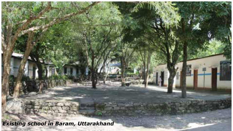
Existing school in Baram, Uttarakhand