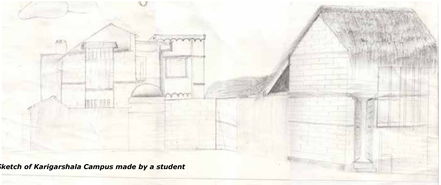
Sketch of Karigarshala Campus made by a student

The students of Karigarshala completed their on-campus learning period in their respective courses of carpentry and walling systems. 7 students were enrolled in the carpentry course while the walling system had 19 students. Both the batches also learnt and studied basic mathematics, life sciences and sketching along with the basics of plumbing and electrical work.