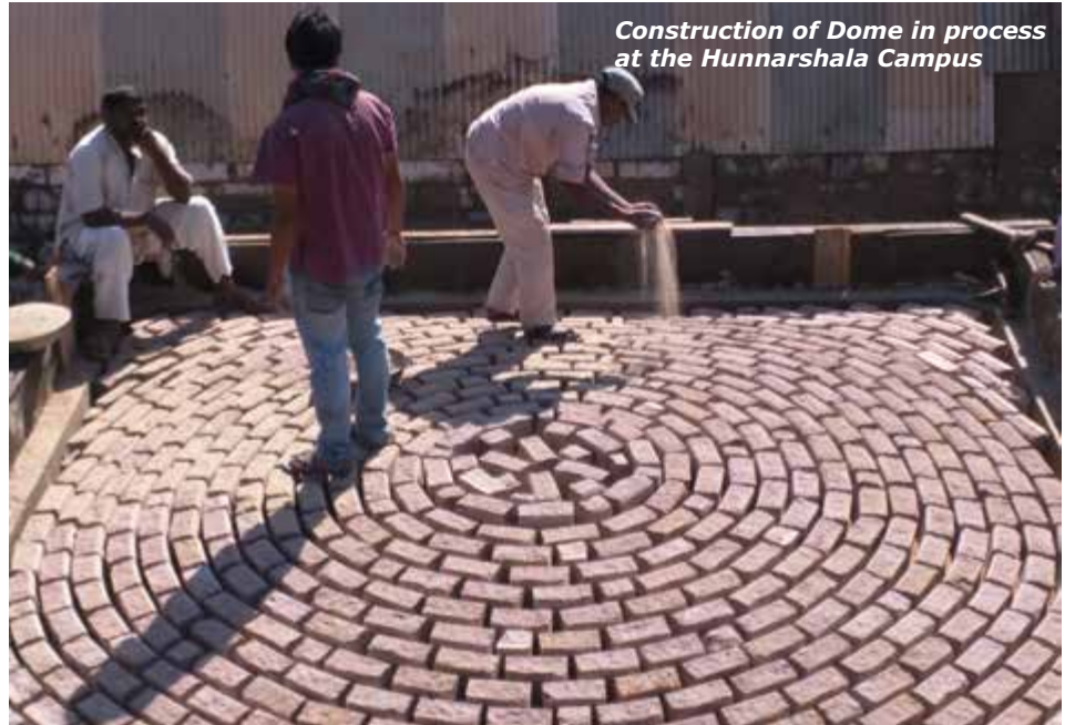
Construction of Dome in process at the Hunnarshala Campus

Two tests were conducted in the Hunnarshala campus to understand the behavior and strength of the dome by subjecting it to static loading. Nawab, an artisan from Muzzaffarnagar who has been making the shallow domes was called to make these domes. The data generated from the first test was analysed and subsequent alterations and changes were made to the dome before testing it the second time. This shallow dome built with Compressed Stabilised Earth Blocks (CSEB) took five times the live load stated for residential buildings and would now be tested for dynamic loading.