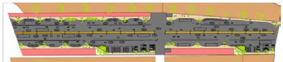
Proposed Lane Management