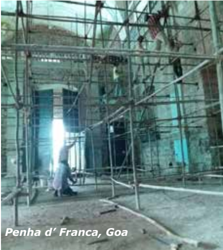
Penha d' Franca, Goa

The restoration work at The Church - Penha de Franca in Goa is ongoing. The application of lime plaster works on the interior walls, exterior walls and ceiling are complete. The artisans of “Lustre- specialists in finishes” are working on application of Lime plaster on the exterior surface of vaults.