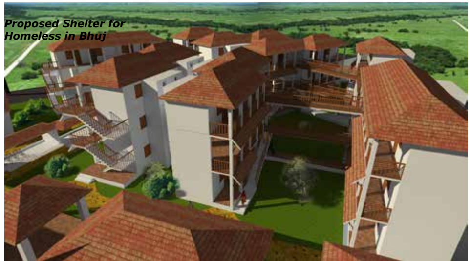
Proposed Shelter for Homeless in Bhuj

The proposal for developing rental housing for homeless migrants at RTO site has been completed and submitted to the Bhuj Nagarpallika for approval. The proposal includes various typologies of rental housing like family shelter, accommodation for singles and shelter for people with special needs. The program comes under the National Urban Livelihoods Mission’s (NULM) ‘Shelter for Homeless’ scheme.